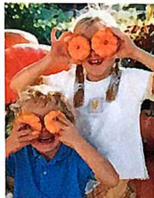
Tiny 'Jack Be Little' pumpkins make big fun for children.