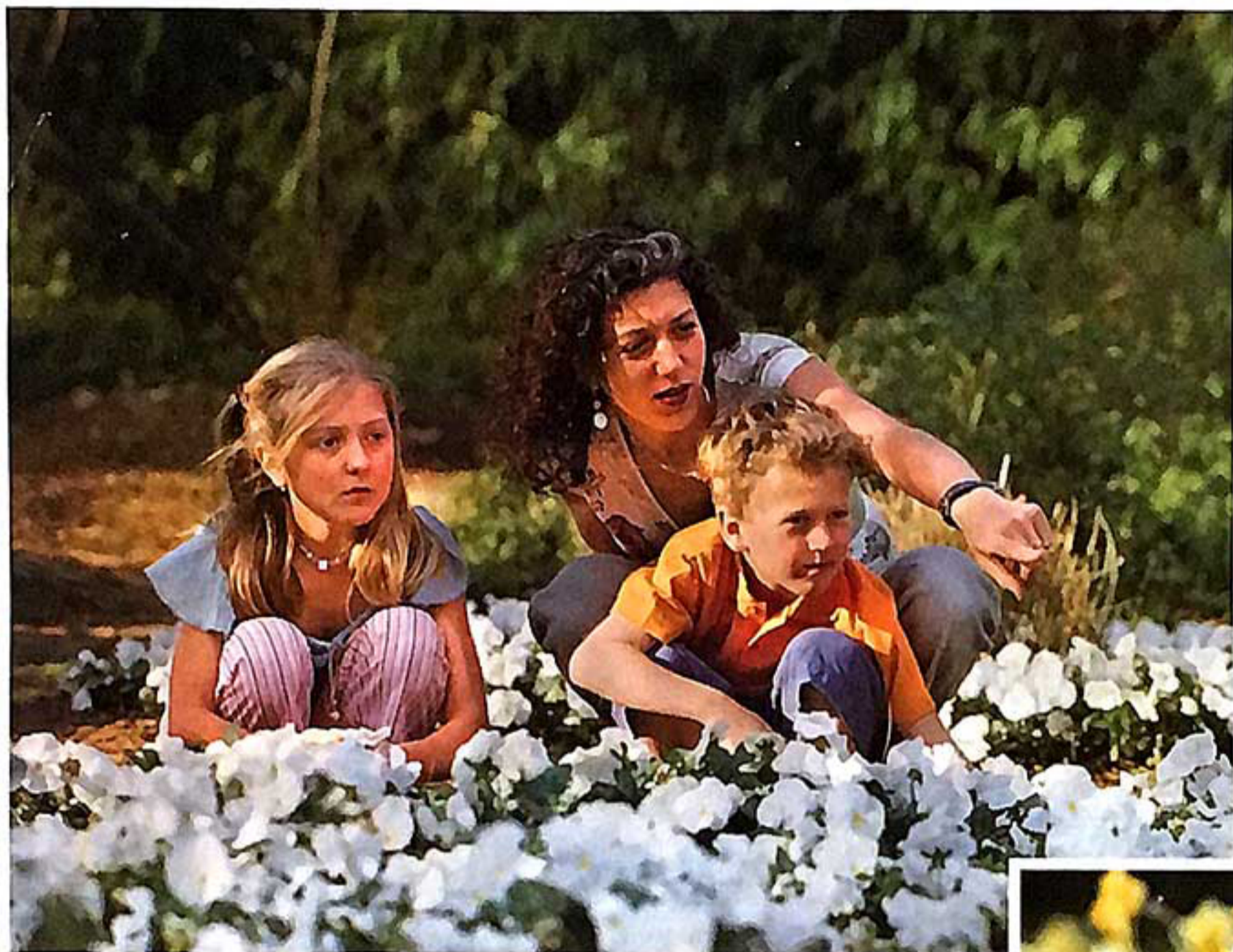
below: The 7-acre Mynelle Gardens, just a few minutes off the interstate, showcases a variety of blooms that herald a season of bright color.